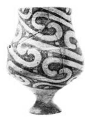
Pottery of the Cucuteni culture (4800 to 3000 BC)

If you look at a physical map of Romania, observe the shape of the Transylvanian Plateau: you could say that our country forms a great circle around Transylvania. Well, that was where the Romanian nation was born.